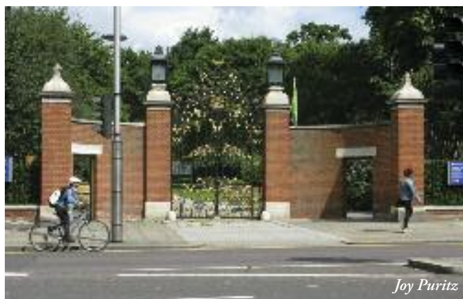
The gates in June 2017