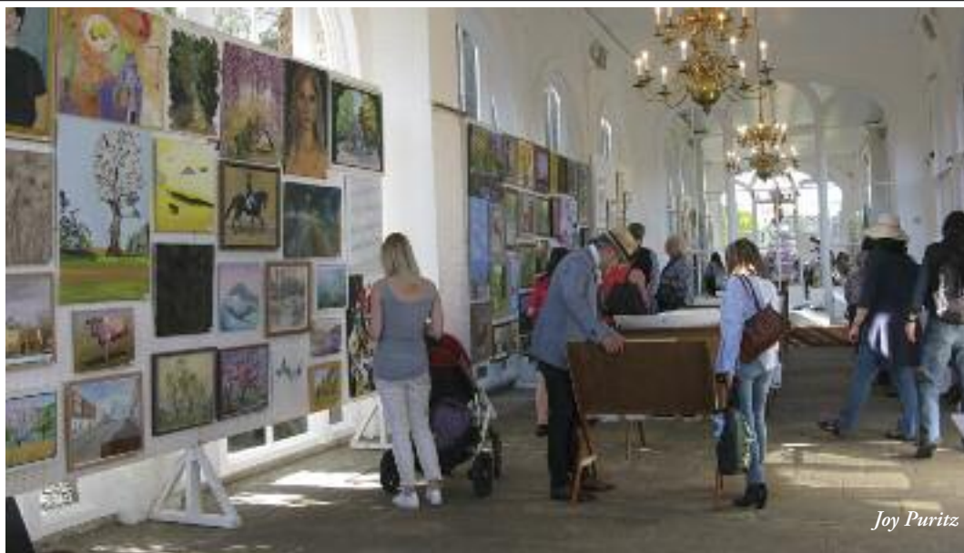
Art Exhibition 2017 in the Orangery

It was a pleasure to judge 'The Friends of Holland Park Art Exhibition 2017'. We are so lucky to have such a wonderful park on our doorstep; walking through the park reminds me that it should never be taken for granted. The exhibition was beautifully displayed; I appreciate the great care, attention and energy that putting together such an exhibition demands from its coordinators. Thank you.