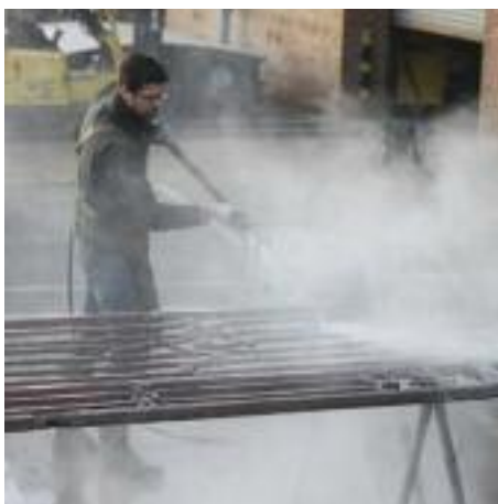
Initial cleaning of gates