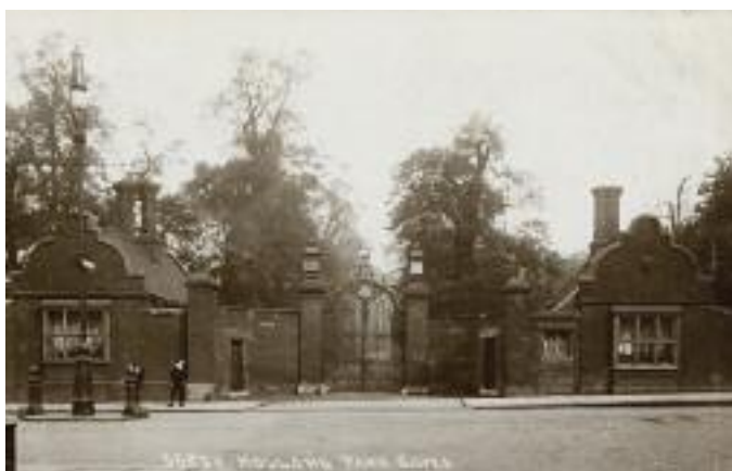
The gates ca 1900, complete with lodges