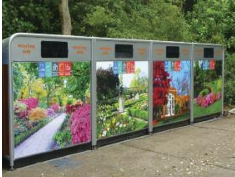
The new recycling units

Following Planning and Listed Building consent for Camlin Lonsdale’s plan to improve landscaping around Holland House, Blakedown Landscapes (SE) Ltd have been appointed to carry out the work. This major project will make the café yard and Holland House terrace much pleasanter spaces in which to spend time, and the re-siting of the access road to the terrace will be safer and less disruptive to café users. Much needed conservation work is proposed for the masonry of the walls and steps related to the terrace. Work will commence in late September 2017 and be completed before the opera build starts in March 2018.